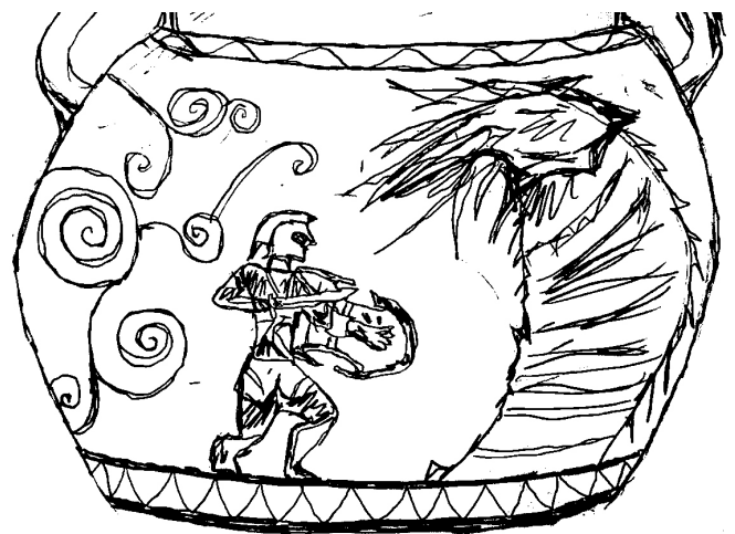
The Roman soldier battling the Vermis

While the PCs investigate the area, the commander will have its own agenda. He's looking for an old parchment that is supposedly hidden somewhere in the city. The parchment contains a spell to summon the Vermis. He actually manages to find it and will hide it in his pocket (not the whole parchment, just the part with the spell). When he goes back to the soldiers, they will notice that his hands and clothes are dirty like he has dug something out of the sand. If asked with a successful Credit creting roll the commander will not say much only that he thought he saw something shiny in the sand and wanted to get it. A Psychology roll will tell that it seems he's not saying the whole story, if questioned further he will say "Remember the ranks soldier(s). Do not bore me with such nonsense."